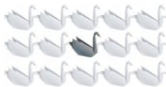
The Black Swan

The publish-or-perish ethic too often favours a narrow and conservative approach to scientific innovation. Mark Buchanan ( http://pagesperso-orange.fr/mark.buchanan/indexMB.html ) asks whether we are pushing revolutionary ideas to the margins.